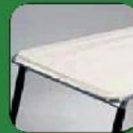
Canopy Top White and Beige