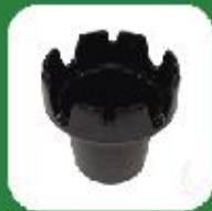
Ashtray Drop in