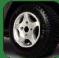
10-Inch Aluminum Alloy Wheels